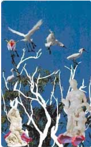
Tessa Payne, Untitled 2 , 2006

Private View April 26 2007 19.00 – 21.00